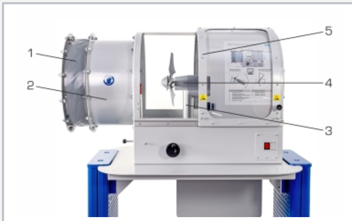
1 connection for HM 170 wind tunnel, 2 flow straightener, 3 tower, 4 wind turbine, 5 protective cover