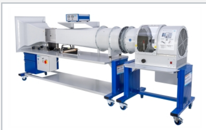
Open wind tunnel HM 170 together with HM 170.70