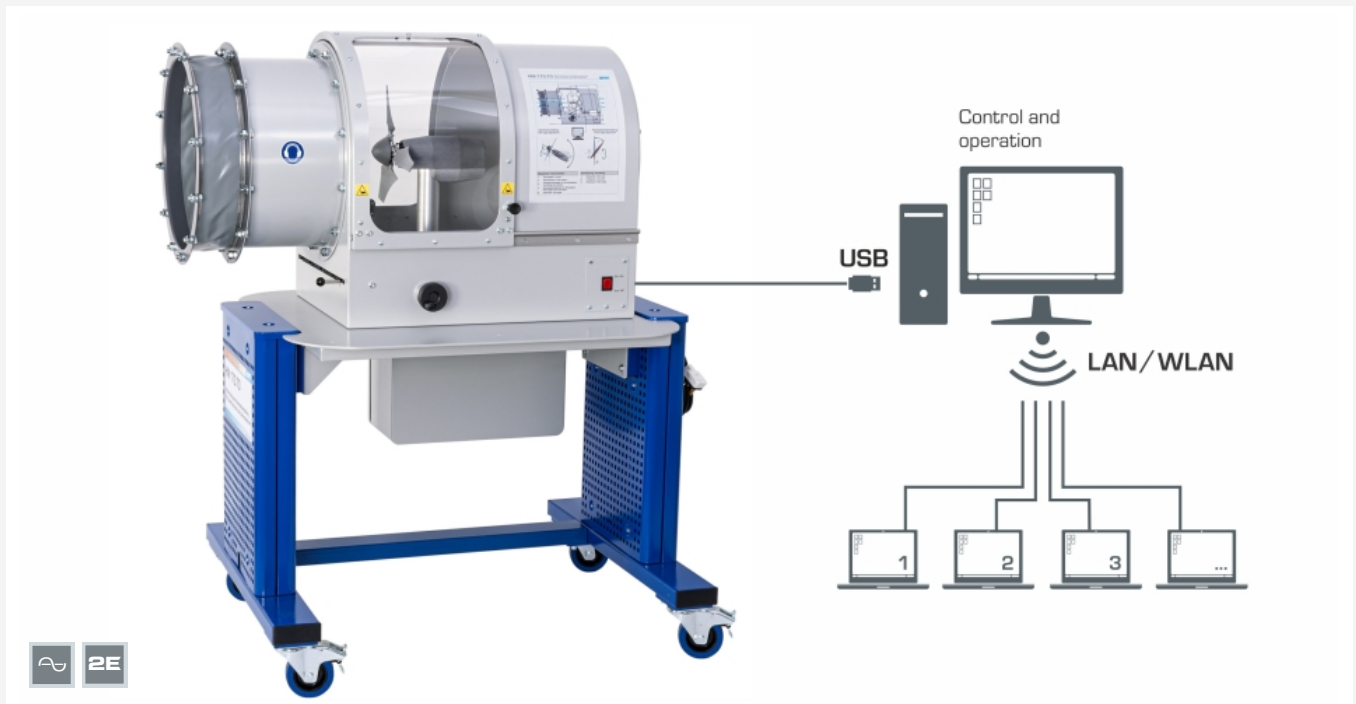
Network capable GUNT software: control and operation via 1 PC. Observation, acquisition, analysis of the experiments at any number of workstations via the customer's own LAN/WLAN network.