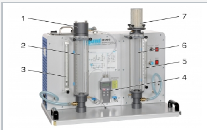
1 water overflow, 2 tank for water, 3 rotameter for water, 4 hand-held measuring unit, pressure loss, 5 rotameter for air, 6 tank for air, 7 filter