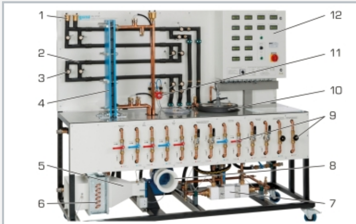
1 bleed valve, 2 tubular heat exchanger, 3 temperature sensor, 4 plate heat exchanger, 5 air duct, 6 finned tube heat exchanger, 7 shell & tube heat exchanger, 8 fan, 9 adjustable fittings, 10 stirred tank with double jacket and coiled tube, 11 pressure sensor (water), 12 switch cabinet