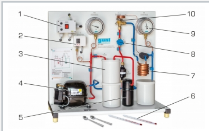
1 main switch, 2 pressure switch, 3 condenser with water tank, 4 compressor, 5 receiver, 6 thermometer, 7 evaporator, 8 sight glass (refrigerant), 9 manometer, 10 expansion valve