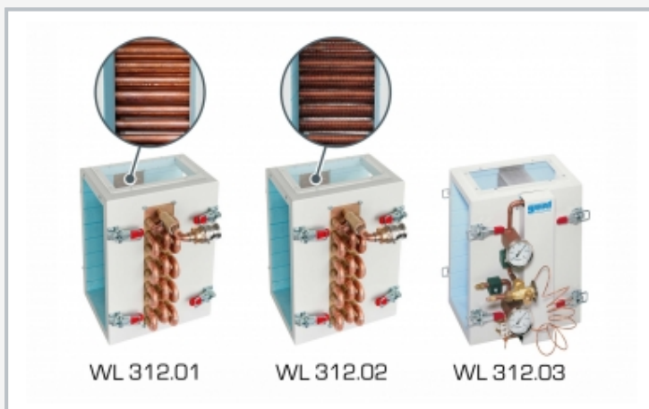
Accessories for the trainer: WL 312.01 Heat transfer with plain tubes WL 312.02 Heat transfer with finned tubes WL 312.03 Heat transfer on refrigerant evaporator