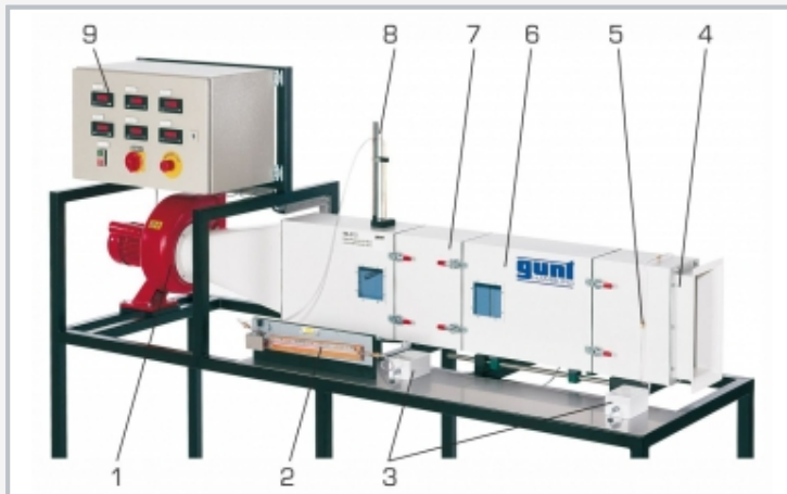
1 fan with throttle valve, 2 inclined tube manometer, 3 differential pressure sensor, 4 streamlined inlet, 5 pressure measurement via measuring nozzle, 6 air duct with windows, 7 measuring section for exchangeable accessories, 8 Pitot tube, 9 displays and controls