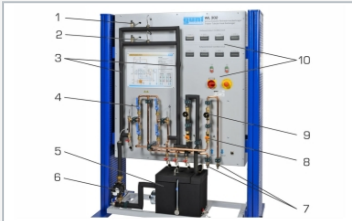
1 bleed valve, 2 temperature sensor, 3 heat exchanger, 4 ball valve for setting the operating mode, 5 tank with heater, 6 pump, 7 water connections, 8 flow meter, 9 valve for setting the flow rate, 10 displays and controls