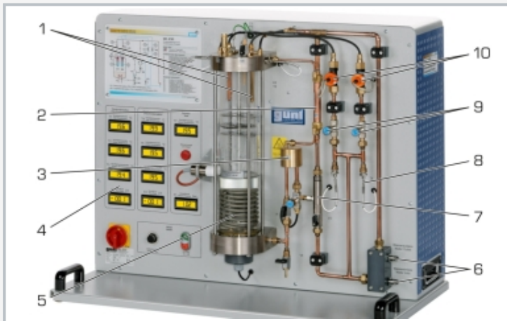
1 condensers, 2 heat exchanger, 3 steam trap, 4 displays for temperature, flow rate and pressure, 5 heater, 6 cooling water connections, 7 water jet pump, 8 temperature sensor, 9 valve for adjusting the cooling water, 10 cooling water flow rate sensor