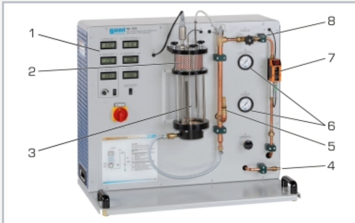
1 display and control panel, 2 air filter, 3 backlit glass reactor, 4 compressed air connection, 5 safety valve, 6 manometer, 7 flow meter, 8 valve for adjusting the air flow rate