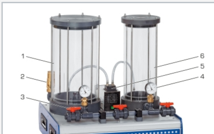
1 positive pressure tank, 2 safety valve, 3 ball valve, 4 manometer, 5 compressor, 6 negative pressure tank