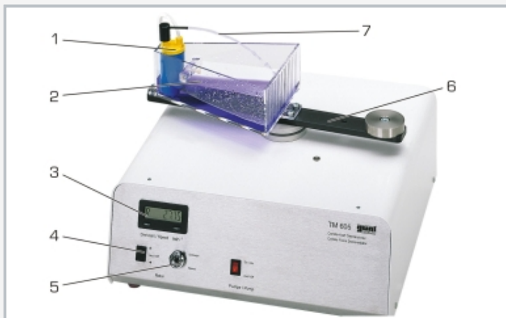
1 pump, 2 water tank, 3 speed display, 4 switch for direction of rotation, 5 speed adjustment, 6 rotating arm, 7 water jet