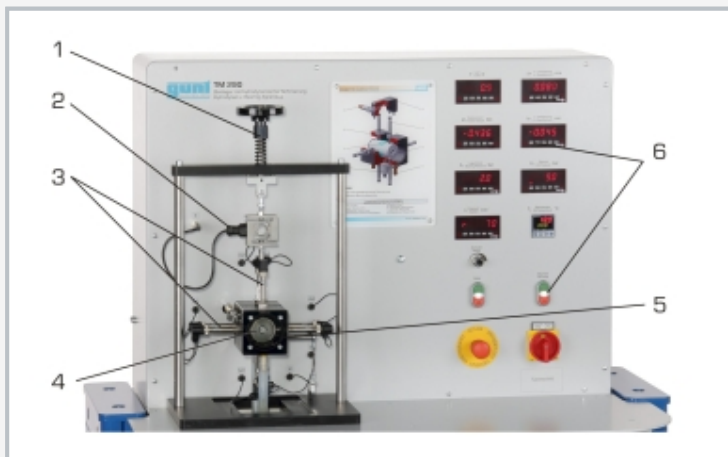
1 handwheel for load, 2 force sensor for frictional moment, 3 inductive displacement sensors, 4 shaft, 5 bearing housing, 6 displays and controls