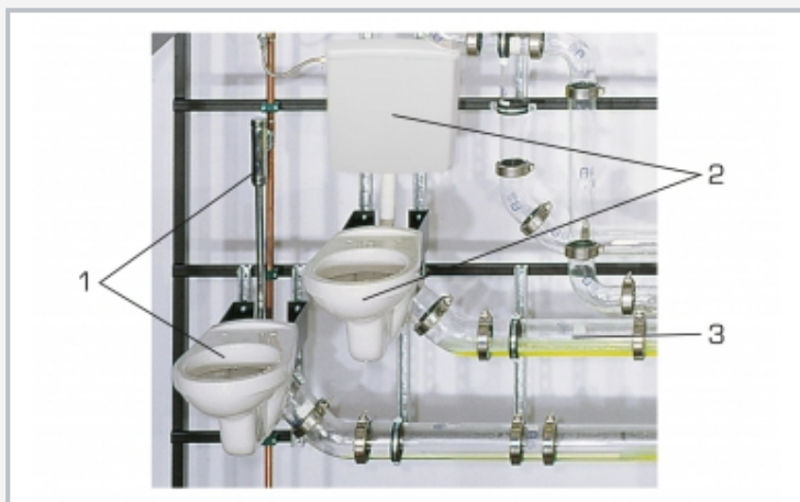
1 toilet bowl pressure flush, 2 toilet bowl with cistern, 3 transparent pipes