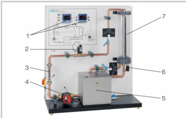
1 controller, 2 control valve, 3 rotameter with electrical output, 4 pump, 5 storage tank, 6 pressure sensor for level measurement, 7 level-controlled tank with overflow