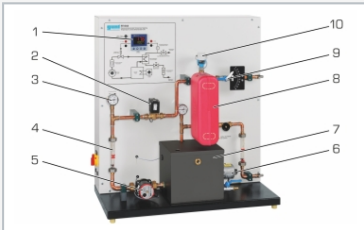
1 controller, 2 control valve, 3 thermometer, 4 rotameter, 5 pump, 6 heater with thermostat, 7 tank, 8 plate heat exchanger, 9 ball valve with scale, 10 temperature sensor at fresh water outlet