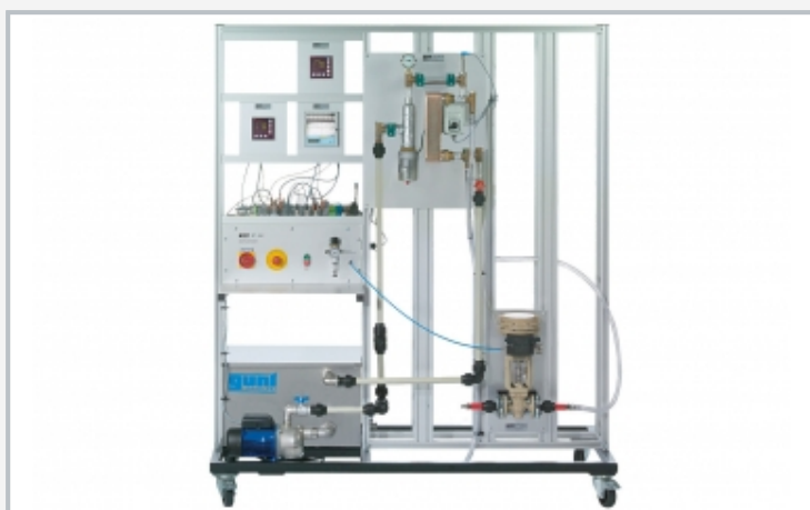
The illustration shows the layout of a temperature control system. In addition to the base module RT 450, it includes the following components: RT 450.04 (controlled system module: temperature), RT 450.11 (controller), RT 450.12 (recorder), RT 450.21 (control valve) and RT 450.36 (temperature sensor).