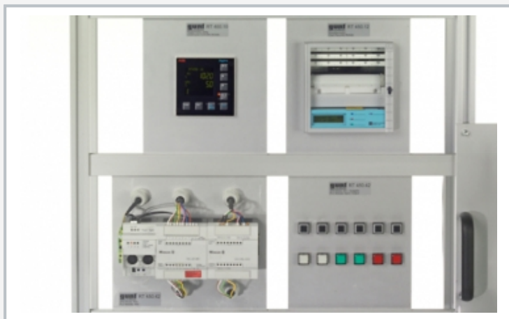
RT 450.10 (controller), RT 450.12 (recorder) and RT 450.42 (PLC module)

The illustration shows the layout of a level control system. In addition to the base module RT 450, it includes the following components: RT 450.01 (controlled system module: level), RT 450.10 (controller), RT 450.12 (recorder), RT 450.21 (control valve) and RT 450.35 (level sensor).