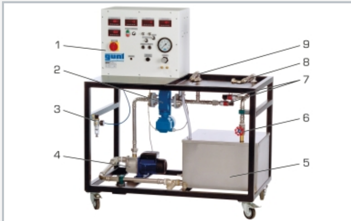
1 switch cabinet with controls, 2 flow rate sensor, 3 pressure reducing valve for air connection, 4 pump, 5 tank, 6 adjustment of flow rate, 7 pressure sensor, 8 outlet control valve, 9 inlet control valve