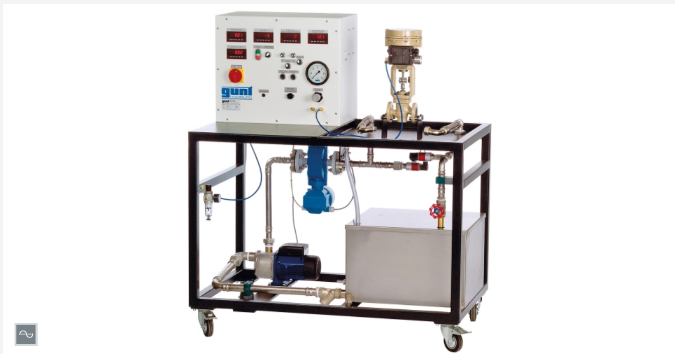
The illustration shows a similar unit with accessory RT 390.01.