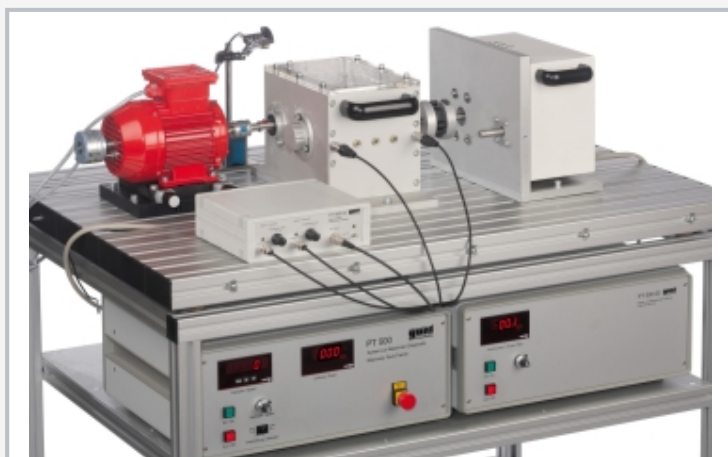
The illustration shows PT 500.15 together with PT 500, PT 500.01, PT 500.05 and PT 500.04.