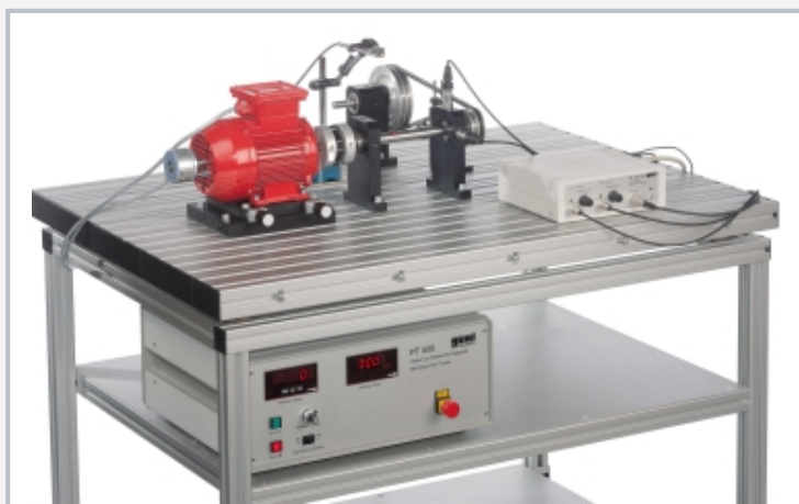
The illustration shows PT 500.12 together with PT 500, PT 500.01, PT 500.14 and PT 500.04.