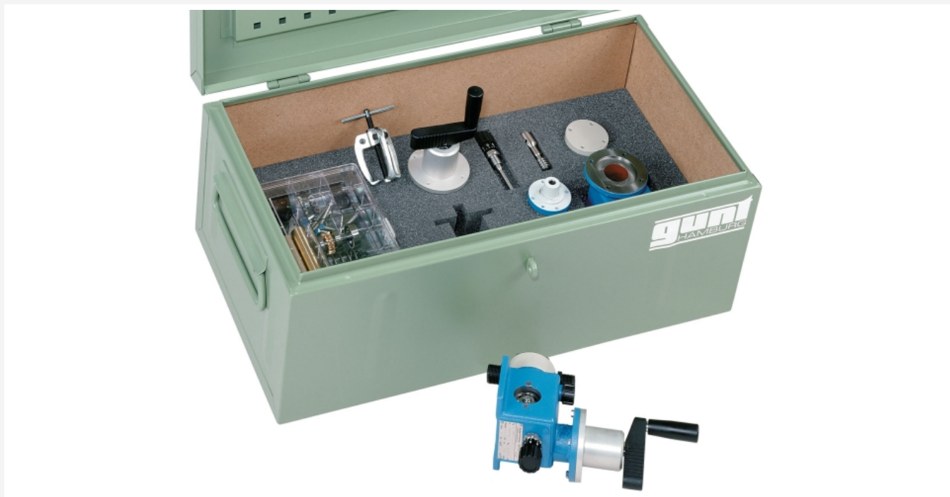
The illustration shows the tool box with kit and tools. The fully assembled pump is shown in the foreground.