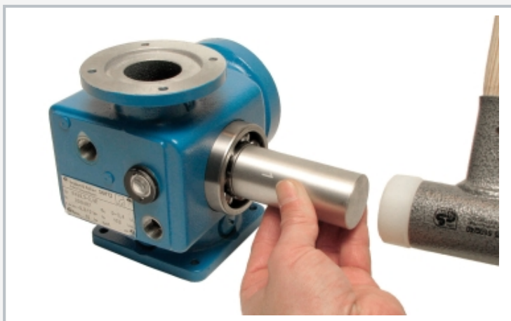
Assembly of the diaphragm pump: driving the eccentric into the housing (using a device)