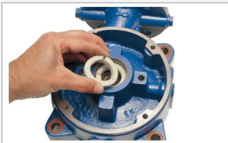
Assembly of the four-stage centrifugal pump: assembling the packing gland rings