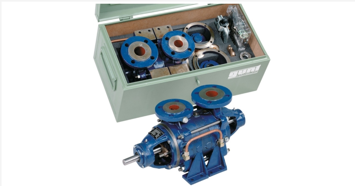
The illustration shows the tool box with kit and tools. The fully assembled pump is shown in the foreground.